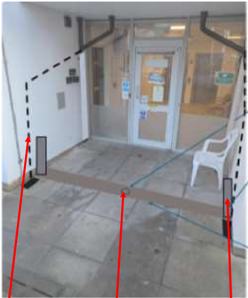
Proposed- everyday use