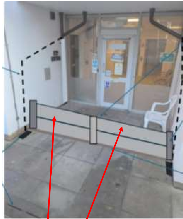
Proposed- during flooding