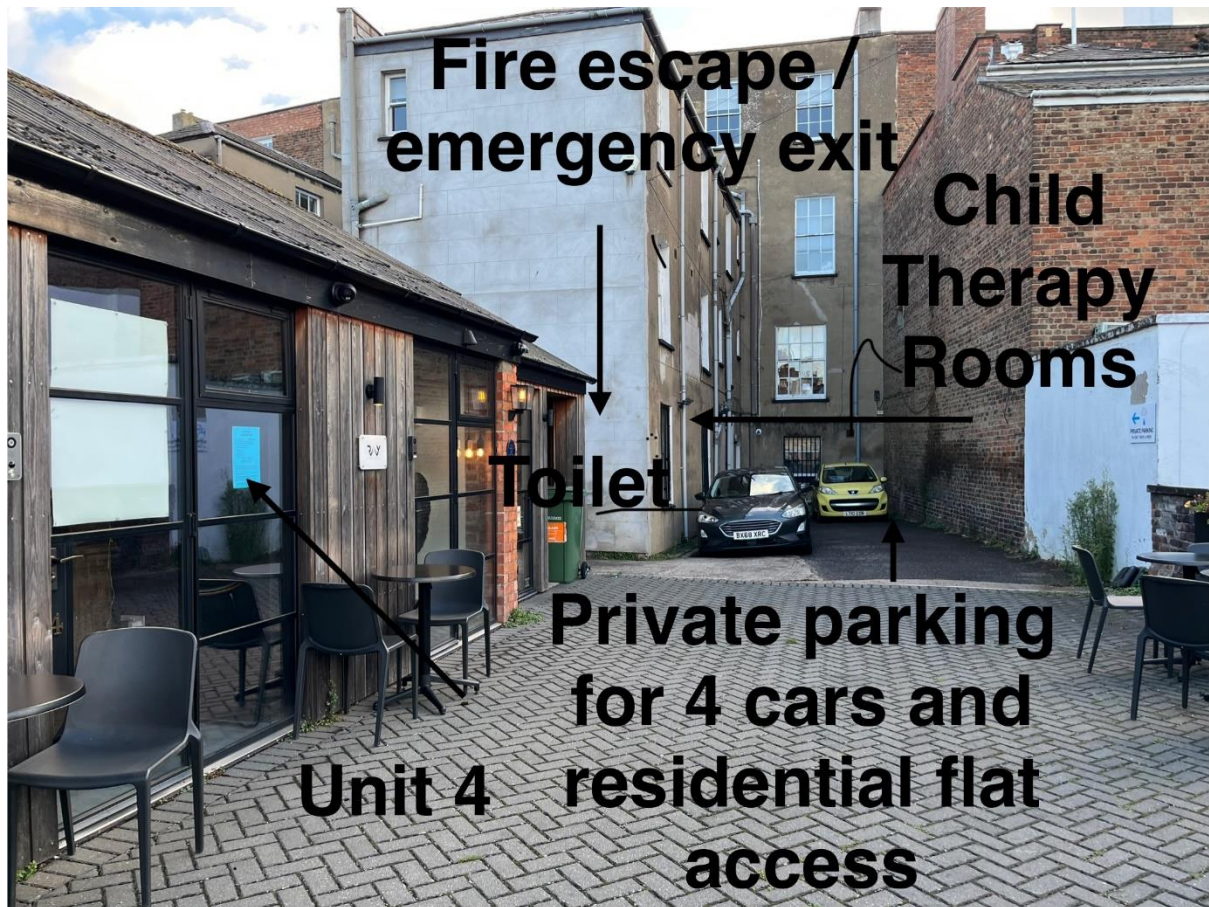
Photo 1: Studio 4 backing onto 15 Royal Crescent, therapy rooms, private flat and marketing agency