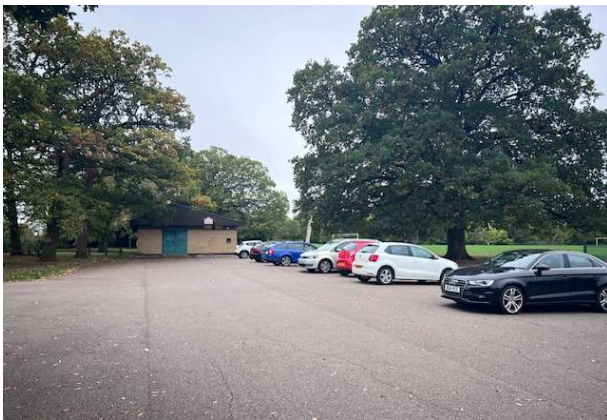
View looking across car park to nursery