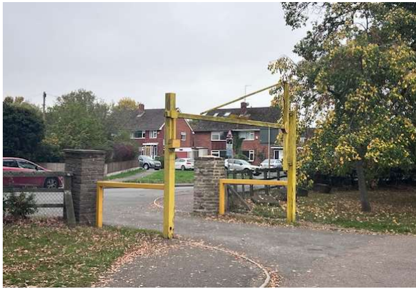
Car park entrance with housing beyond