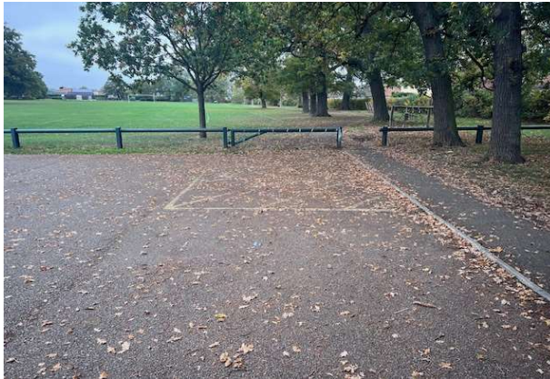
Hatched area opposite