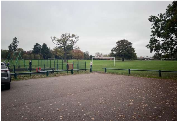
Corner of car park where trailer would be sited