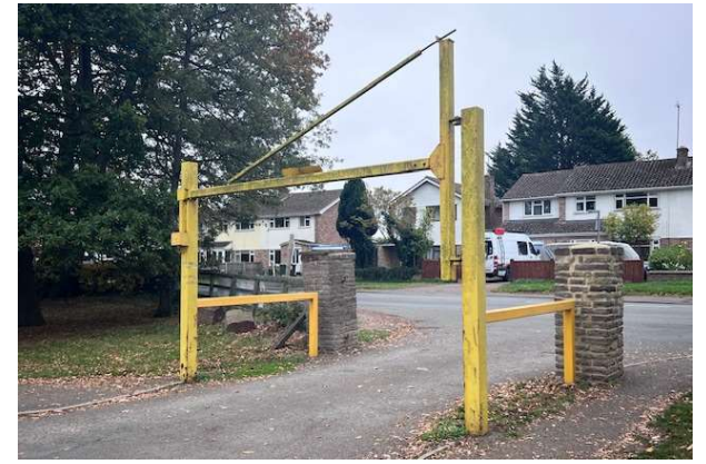
Car park entrance with housing beyond