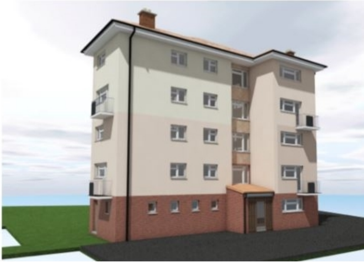
Proposed finish for Grevil Road and Orchard Way