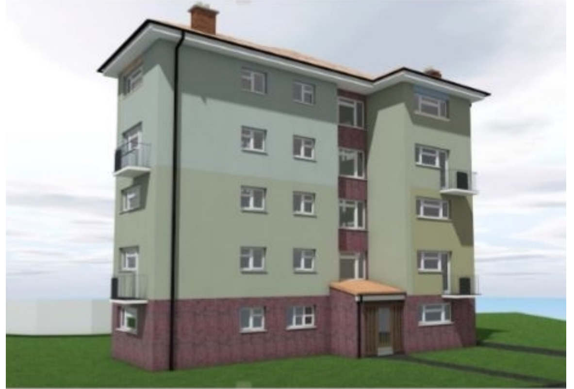
Proposed finish for Arle Road