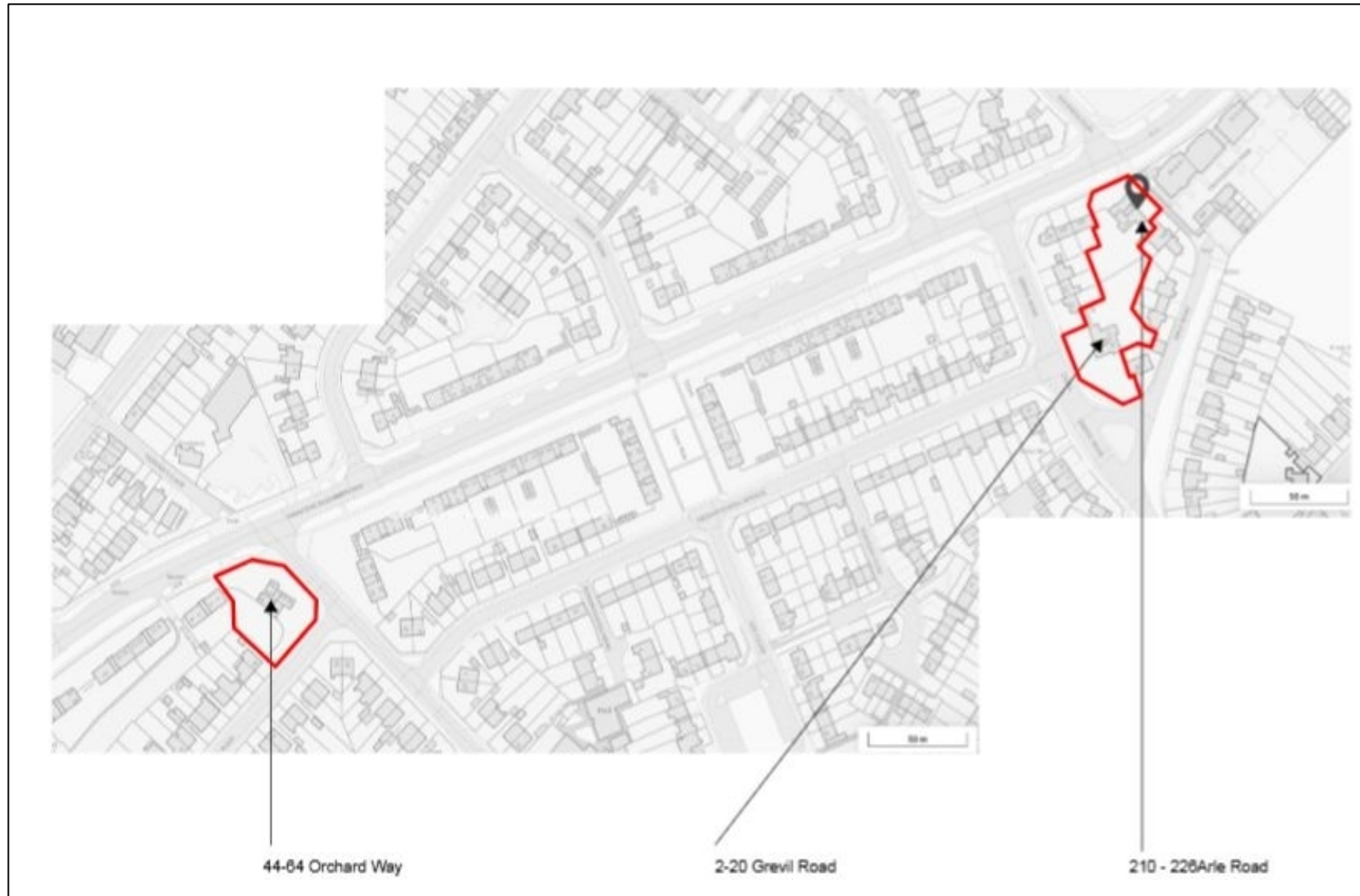
Site Location Plans