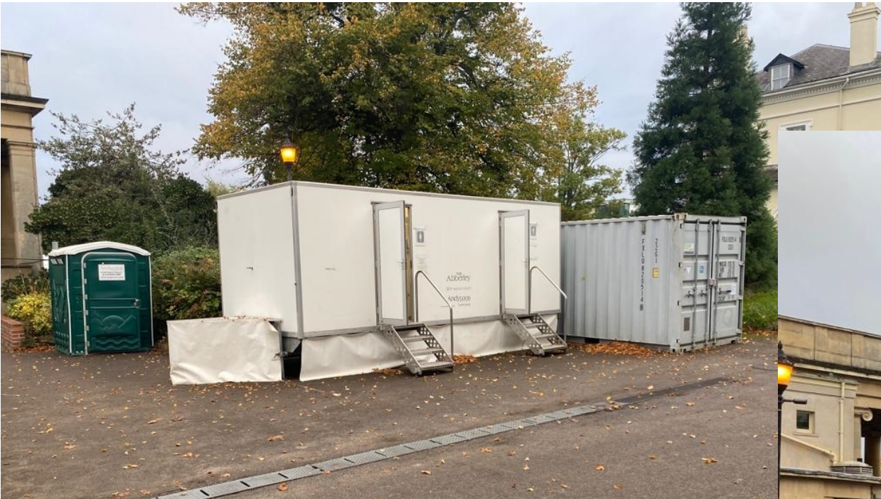
Proposed works include the over cladding of these structures in timber