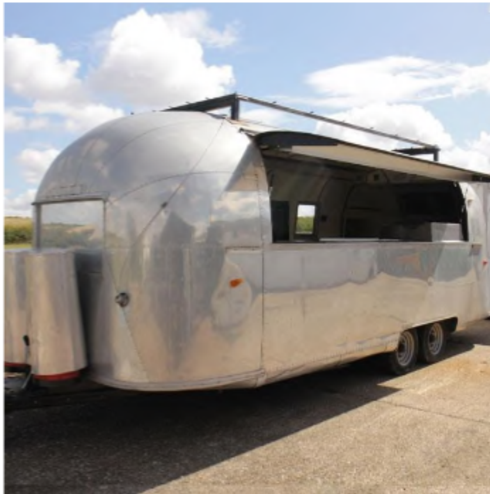
Figure 4 - Picture of example Trailer.

Image from Planning Statement – example of an Airstream trailer