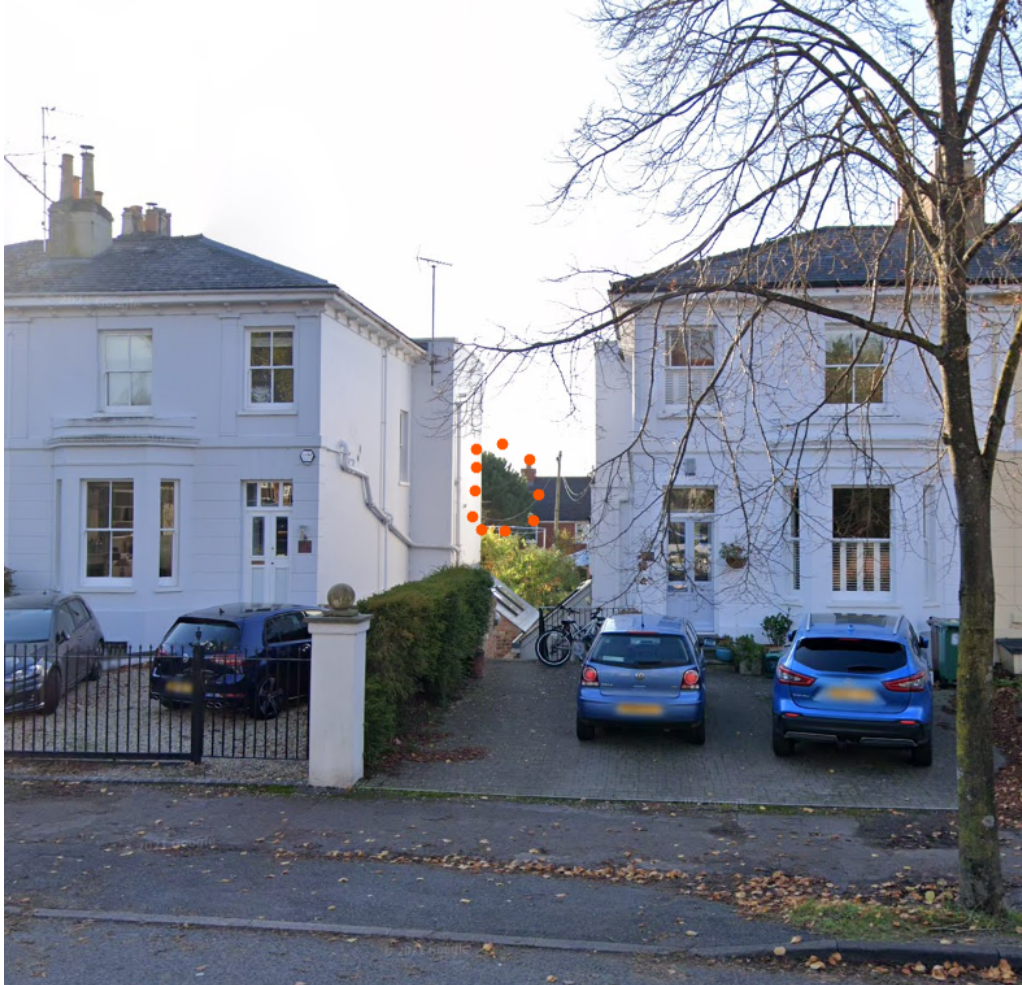
View from Leckhampton Road