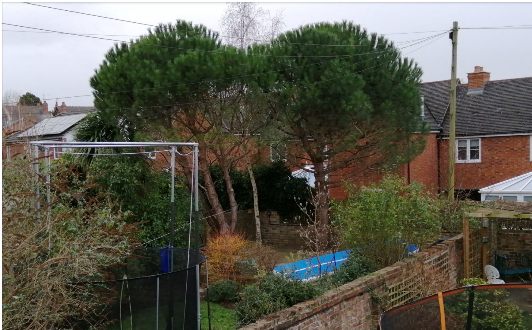
View from 69 Leckhampton Road