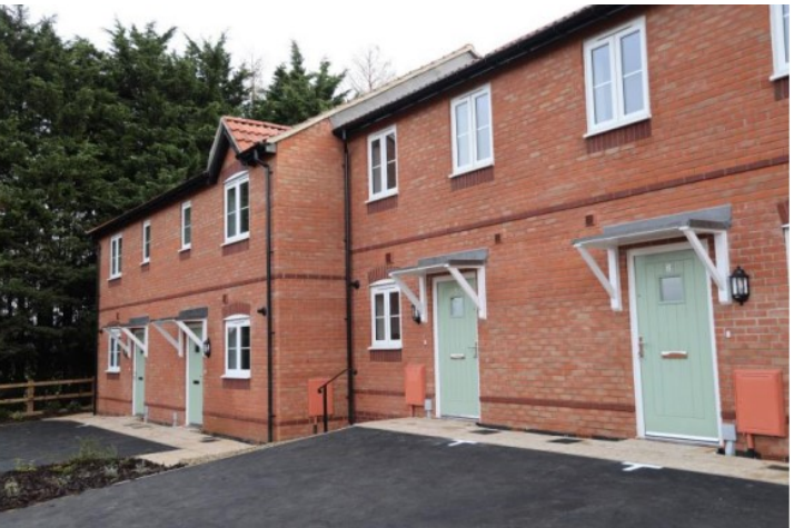
see page 7. Housing and homelessness was also addressed by the committee—see page 8

In February 2024, the Committee considered CBC's current tourism and marketing provision, which accounts for around 4% of borough-wide employment—see page 10