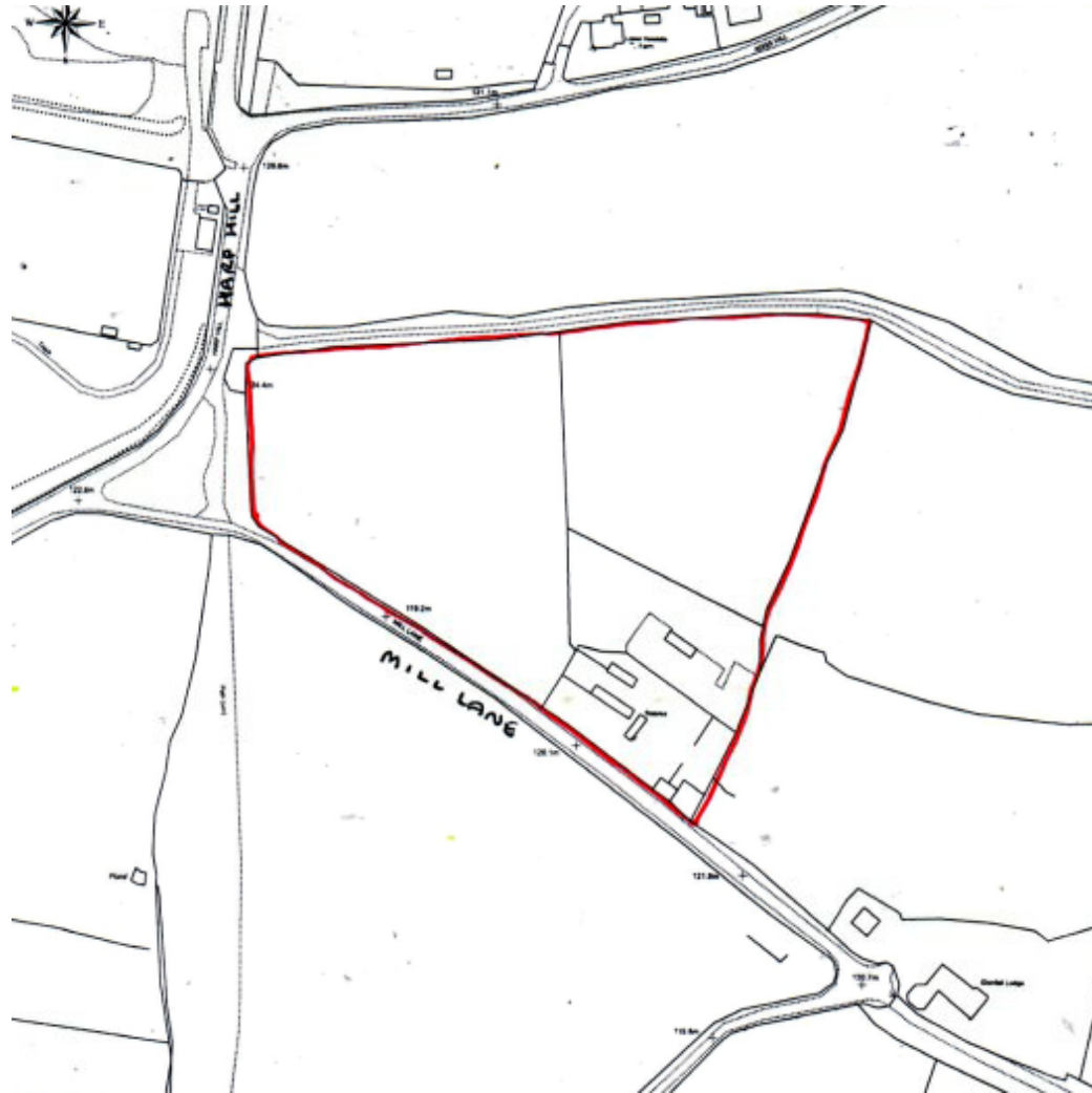
Site location plan