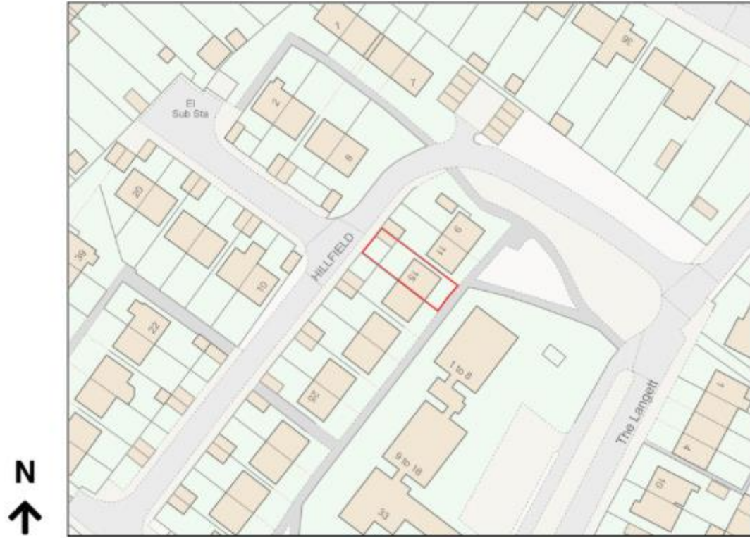
Site location plan