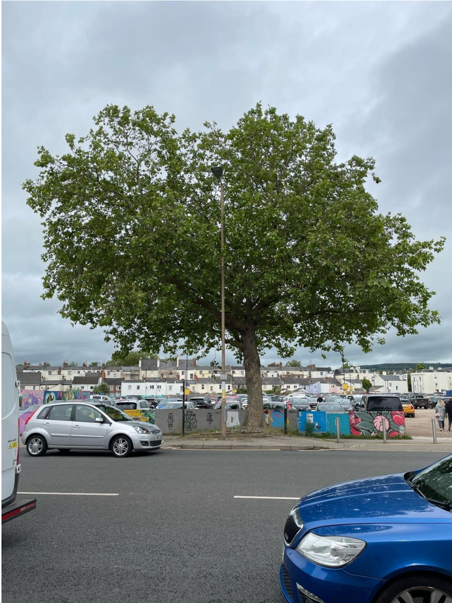
View of plane from St Margaret's Road