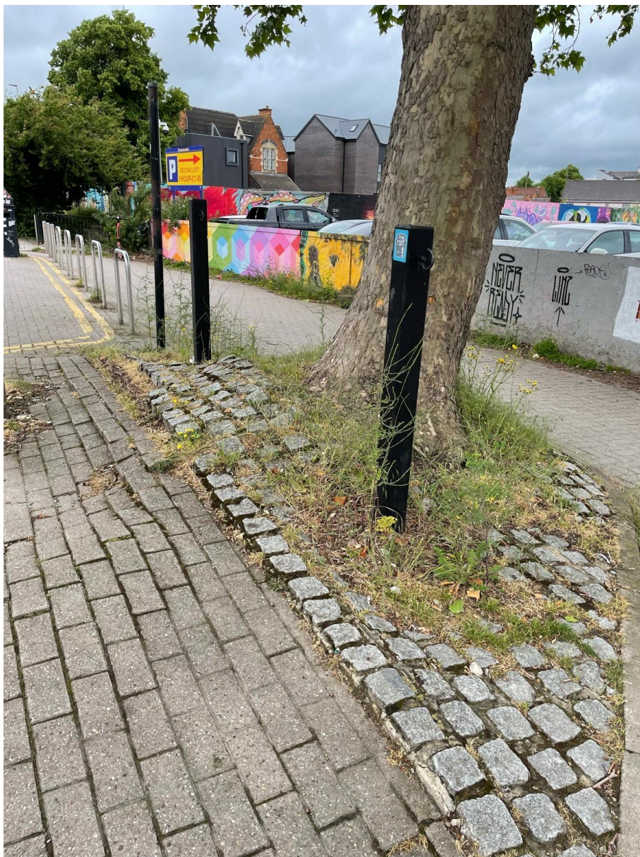
Damage to pavement to south of tree