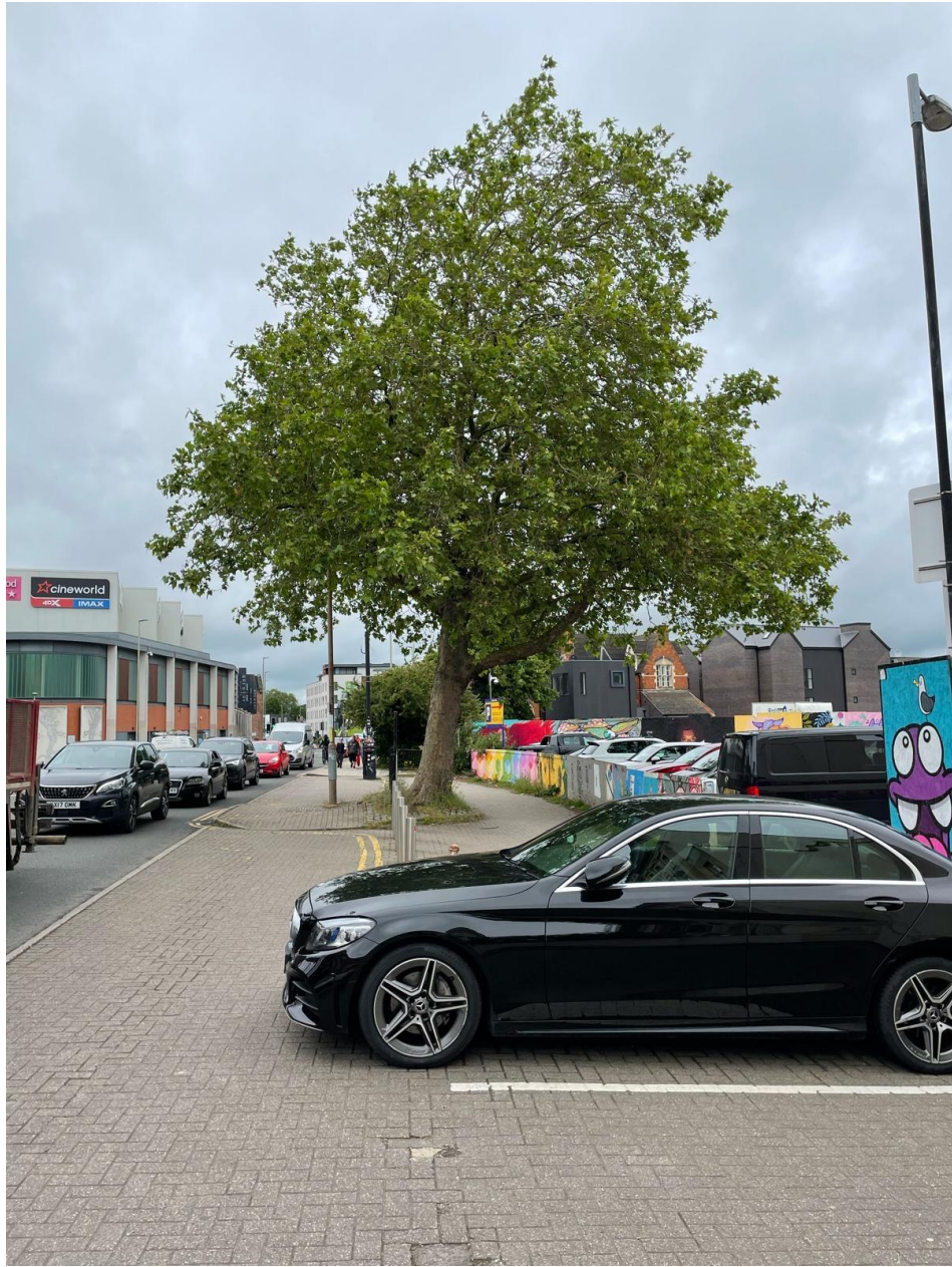
View of plane from St Margaret's Terrace