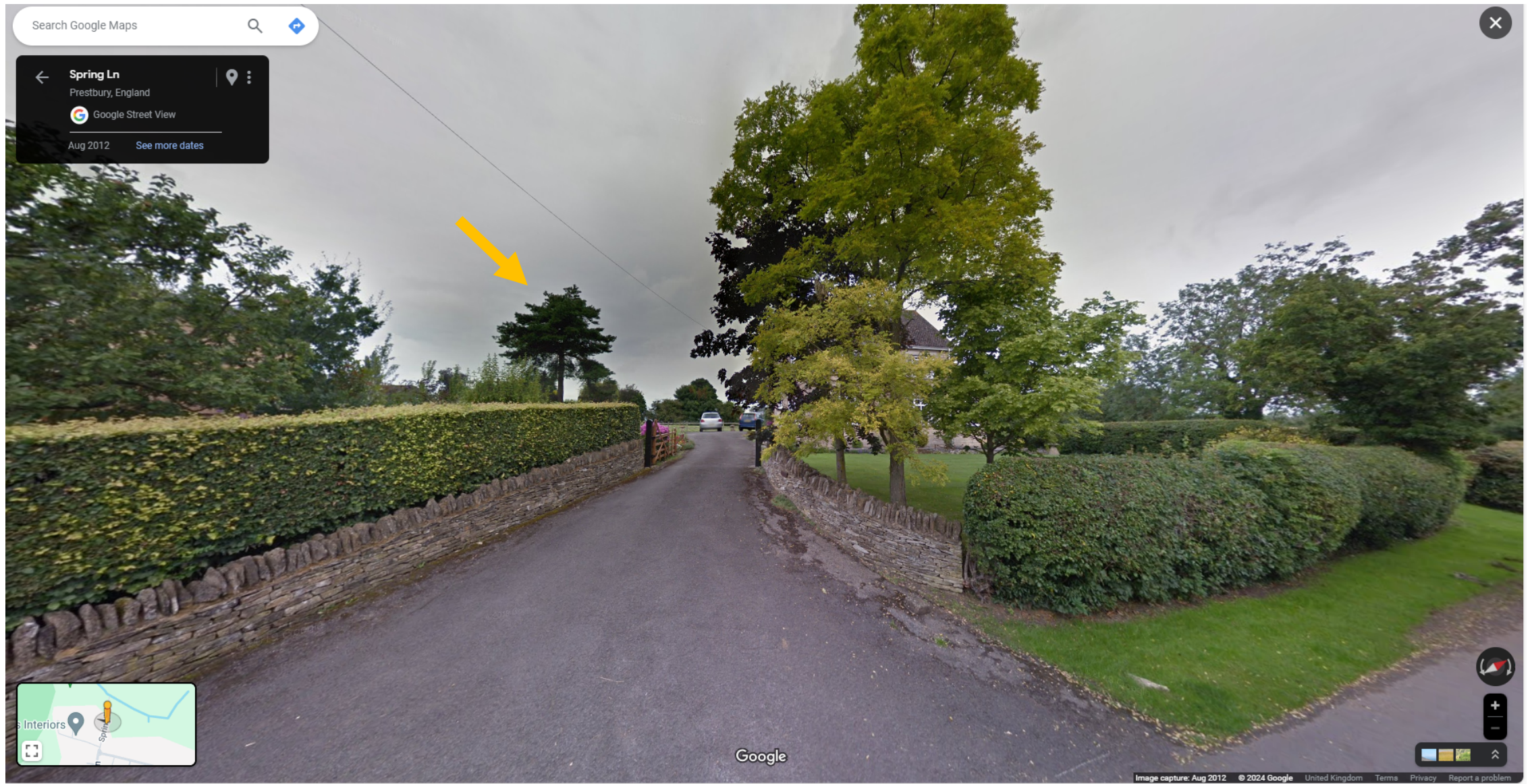
View of pine from Spring Lane