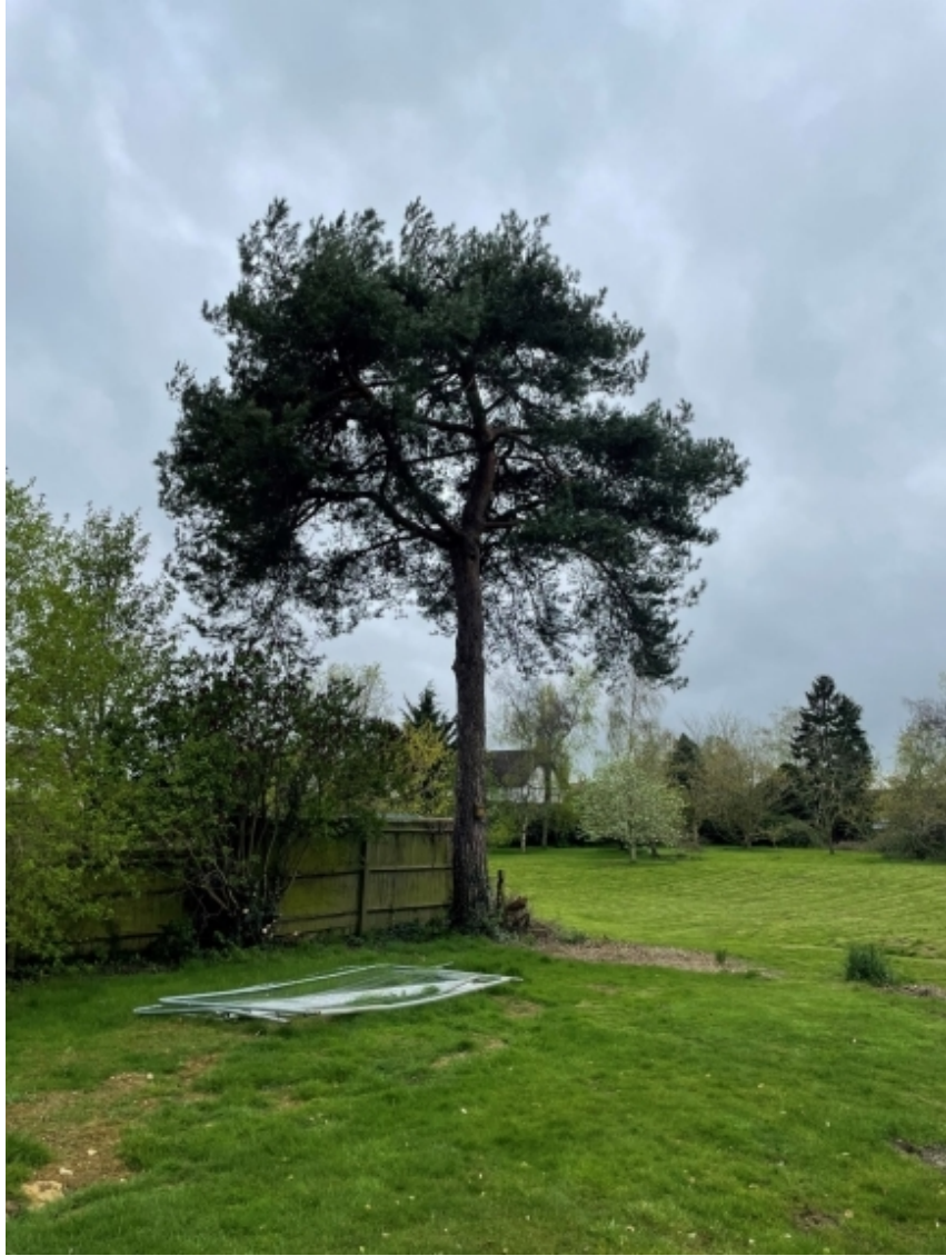
View of pine from garden