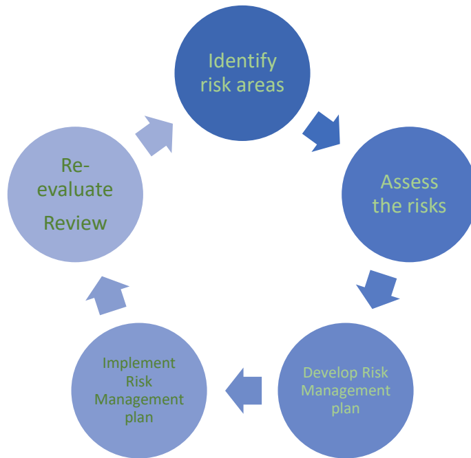
Risk Management Cycle