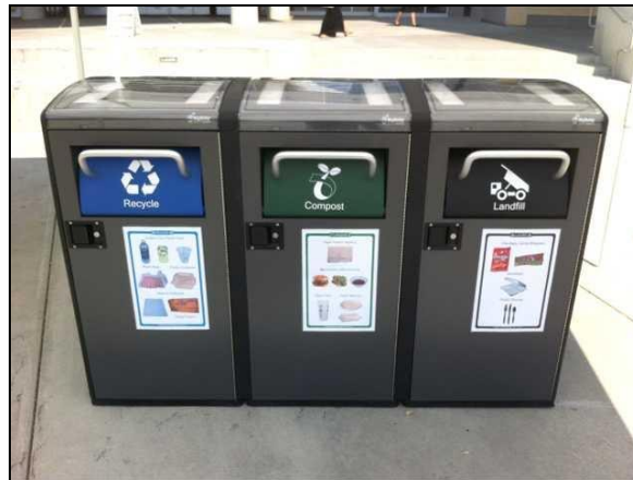
Belly bins can store more waste than traditional litter bins and are gull proof

Recommendation - Replace the food waste storage bins at the Swindon Road depot and ensure the 'spotting compound' is cleared frequently. Review if moving the food waste bins into the shed area has made a difference during the nesting season 2019.