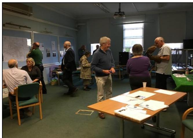
Attendees talking to members of the Gull Task Group at the drop-in event