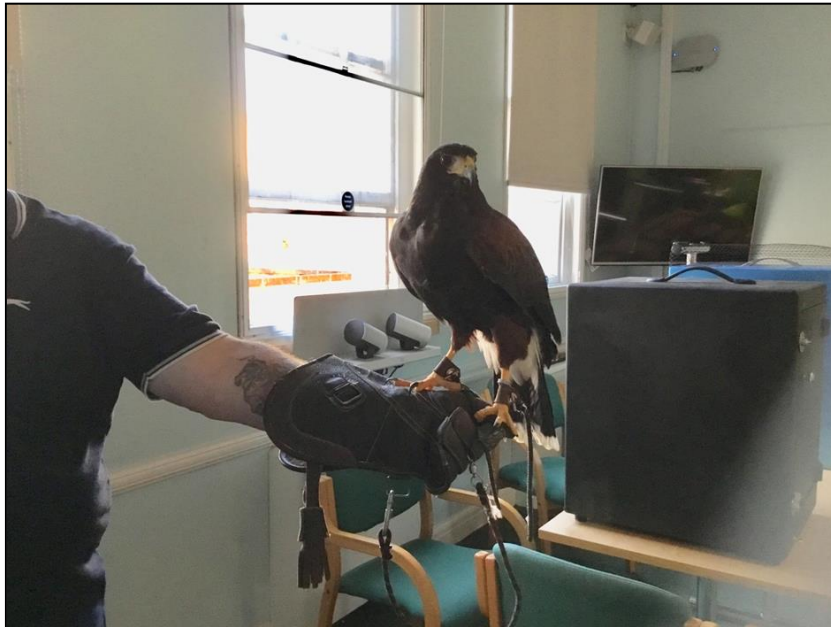
A hawk used to deter gulls from nesting

9.9. The Task Group has been made aware, through the consultation process and elsewhere, of local residents who are working together to fund gull-proofing on their properties, egg treatment and the use of hawks to deter nesting. As previously mentioned, in Park Ward two streets paid for a hawk this year which was effective in preventing nesting in these streets, however, there is a suspicion that the gulls moved on and nested in streets nearby. There is another street in Park Ward where, following a very bad experience with nesting gulls this summer, residents worked together to pay for a private contractor to gull-proof their homes. In the Montpellier area, residents in two streets pay a private contractor to treat nests on properties affected. The Task Group welcomes this proactive approach