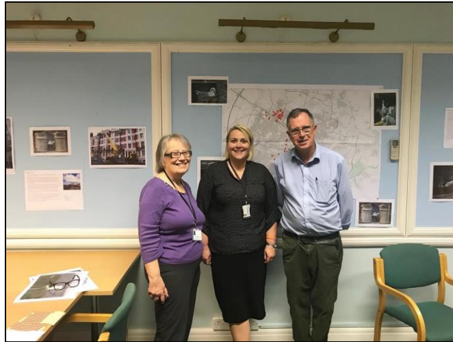
Members of the Urban Gulls Task Group at the drop-in session