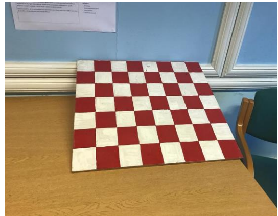
Red and white chequer board made by a local resident that has so far stopped gulls nesting on their property

Recommendation - Work with the BID and other business organisations to encourage traders to present their waste correctly.