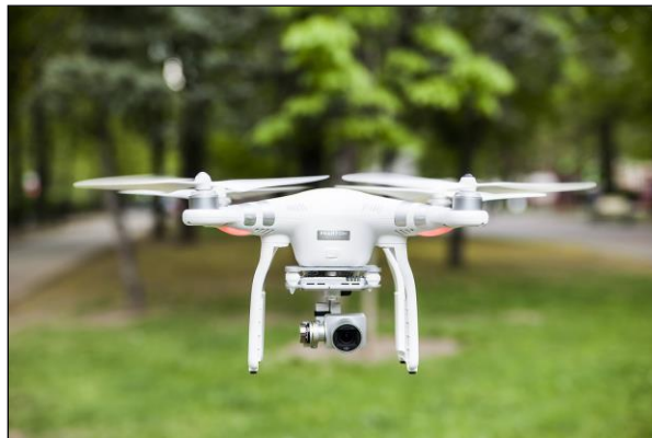
The use of a drone could help identify nest sites more effectively

Recommendation - Recognising that in the short timescale available it will not be possible to find and treat every nest, CBC to take a more proactive approach to treating nests on residential properties. Where CBC cannot safely access the property to treat the nest, give information to property owners about private contractors who may be able to undertake the work