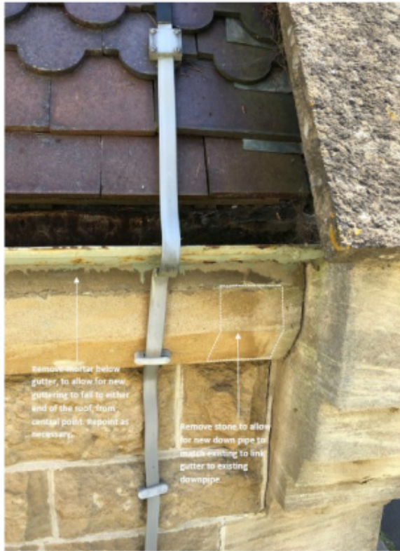
Figure 5. Close up of stonework to be removed for new down pipe.